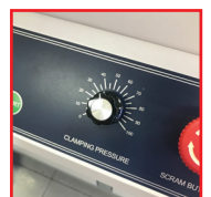
SPINE PRESSURE ADJUST