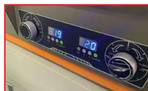
DIGITAL BOOK SPINE ADJUSTMENT