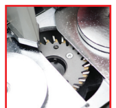
SUN MILLING CUTTER