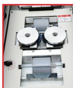
SIDE GLUE PORT