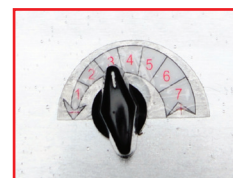
GLUE THICKNESS ADJUSTMENT