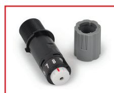
CAMEO RATCHET BLADE