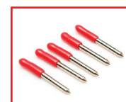
STICKER CUTTING BLADE 45° & 60°