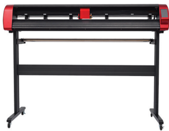
RTDHSCM24 / RTDHSCM48

Model : ROYALTECH RTSCM330RTR Max. Paper Feeding Width : 330mm Max. Paper Cutting Length : Unlimited Max. Paper Roll Diameter : 450mm Cutting Force : 10 – 1000 (gsm) Cutting Speed : 800 mm / s Cutting Precision : < ± 0.025mm Feeding Mode : Roll To Roll Display Mode : Touch Screen Position Mode : Registration Mark Software : SignMaster Interface : USB / Pendrive Power Supply : 220V Dimensions (LxDxH) : 1172 x 872 x 1007 (mm) Weight : 132kg