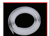
STICKER CUTTING STRIP