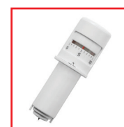
CAMEO AUTO BLADE