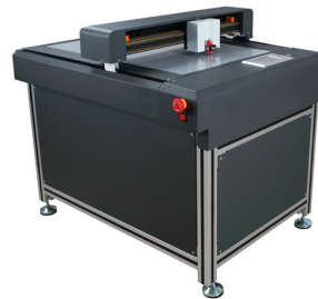
RTDH4560FP / RTDH6090FP