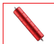
CREASING BLADE HOLDER

Model : ROYALTECH RTSCMA3 Max. Cutting Area : 305 x 305 (mm) with cutting mat Maximum Media Thickness : 2mm Maximum Cutting Force : 210gf Compatible Media Types : Vinyl, Heat Transfer Material, Cardstock, Photo Paper, Copy Paper, Rhinestone Template Material, Fabric Interface : USB 2.0 High-speed Dimensions (LxDxH) : 572 x 152 x 216 (mm) Weight : 4kg