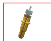
STICKER CUTTING BLADE HOLDER