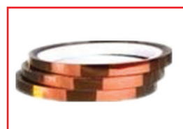
HEAT PRESS TAPE