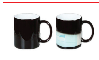
MAGIC COATED MUG