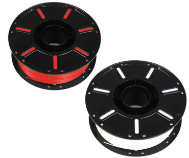
3D PRINTER PLA MATERIAL

Model : ROYALTECH RT3DP555 Printing Size (Single Head) : 280 x 260 x 310 (mm) Printing Thickness : 0.4mm Material Thickness : 1.75mm Printing Material : PLA / ABS / TPU Nozzle Temperature : 0 – 260 °C Baseplate Temperature : 0 – 100 °C Power Consumption : 150W Dimensions (LxDxH) : 500 x 500 x 531 (mm) Weight : 20.5kg