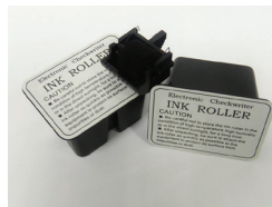
RT310 INK ROLLER